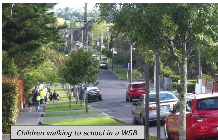
Children walking to school in a WSB