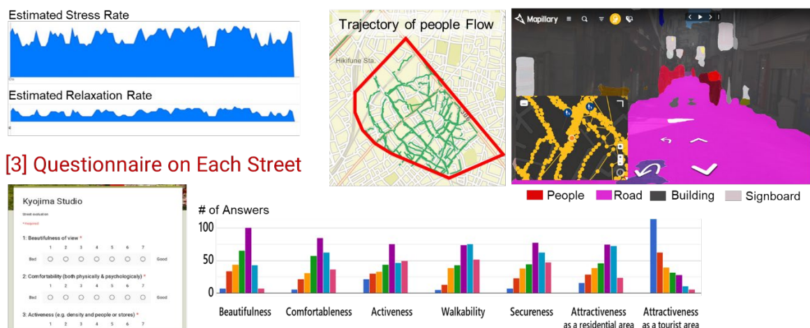
Figure 1. Street experiments in Kyojima district, Sumida ward, Tokyo, Japan